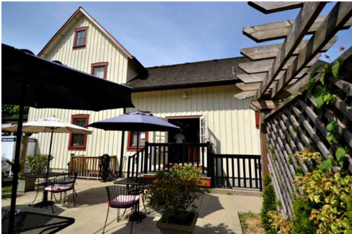
East patio looking west to Boothroyd House, with original building on left. Later addition on right was retained to provide functional space to support the ground floor uses.