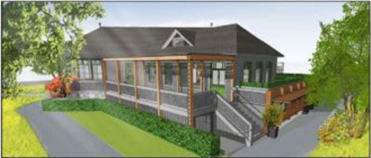
Figure 6: Design Concept - Back Entrance & Concession (northeast view)