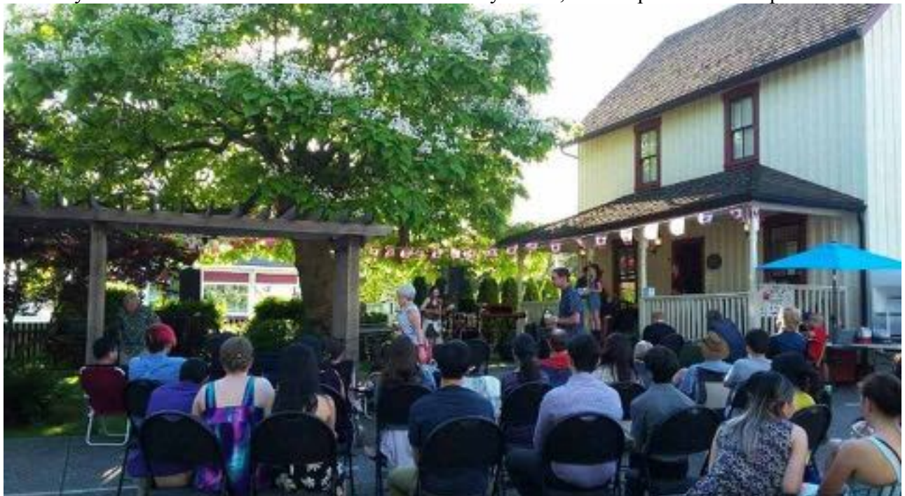
Canada Day celebration with outdoor concert in front of Boothroyd House's southern porch.