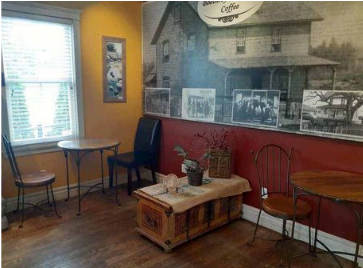
Boothroyd Heritage Coffee interior, features historical photographs and local art