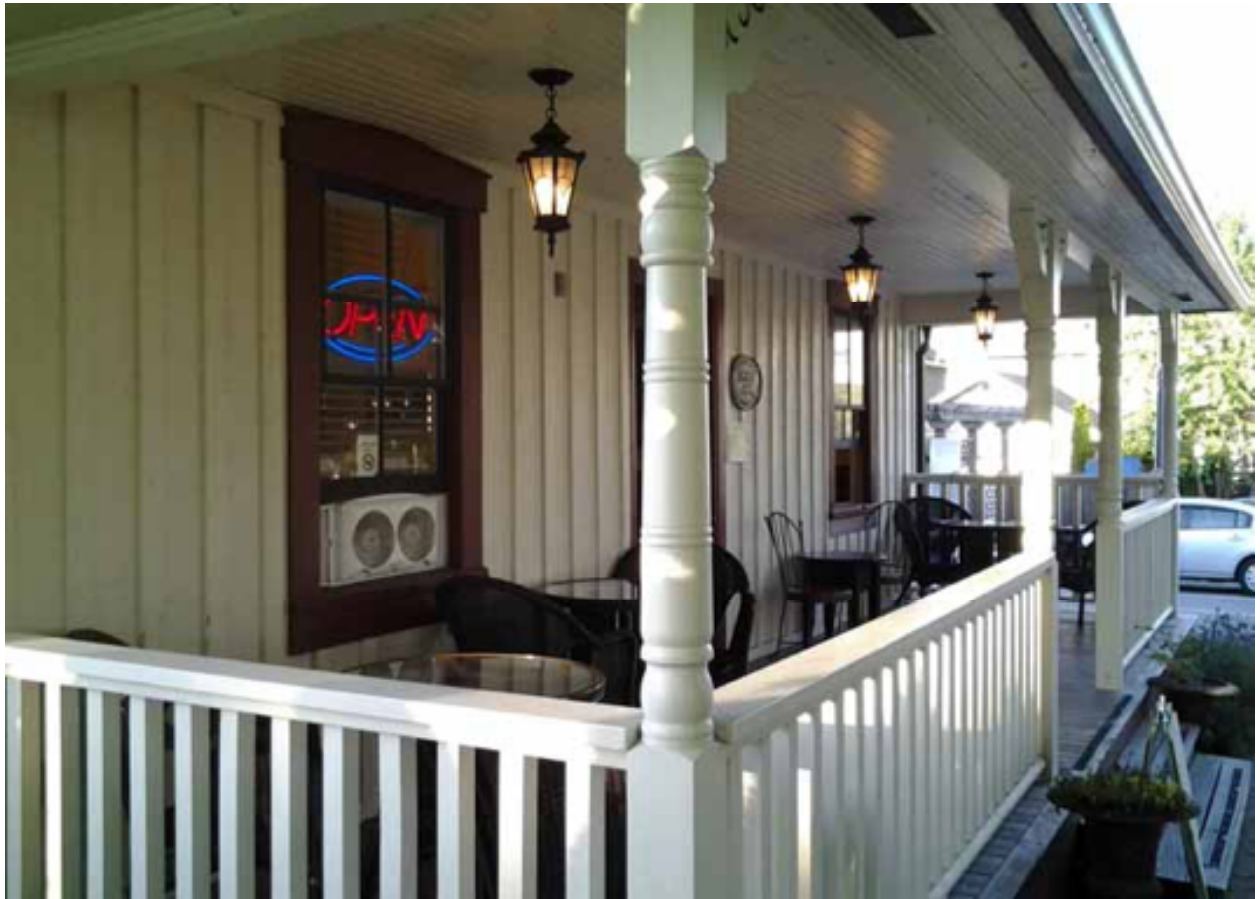
Boothroyd's columns and fretwork are similar to Navy Jack's, to be replicated and replaced.