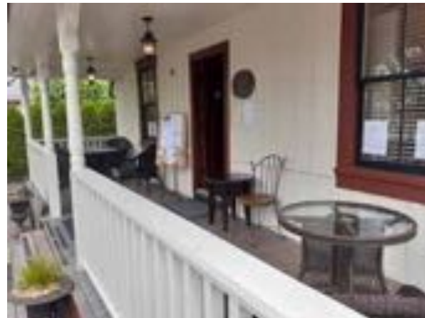
Located at 5 Corners in Cloverdale, Surrey, at 60th Ave. & 168th Street