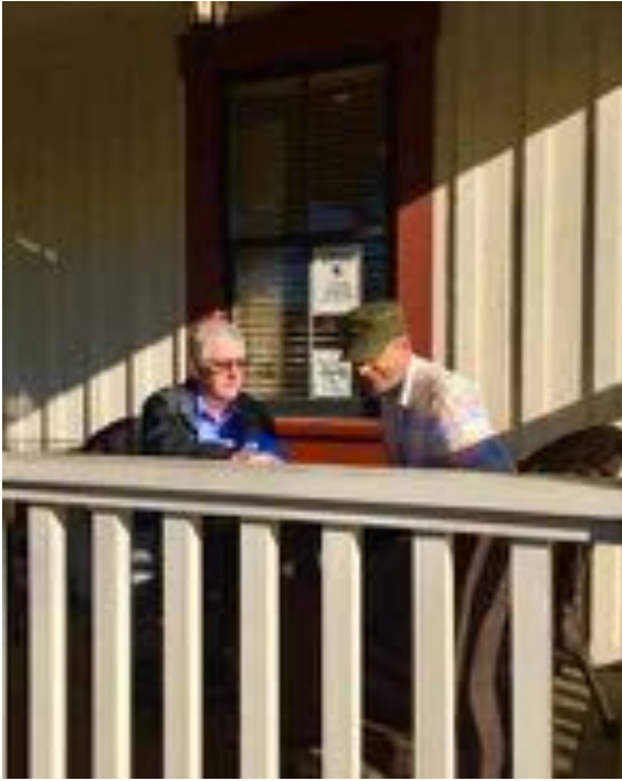
Morning coffee on Boothroyd House porch