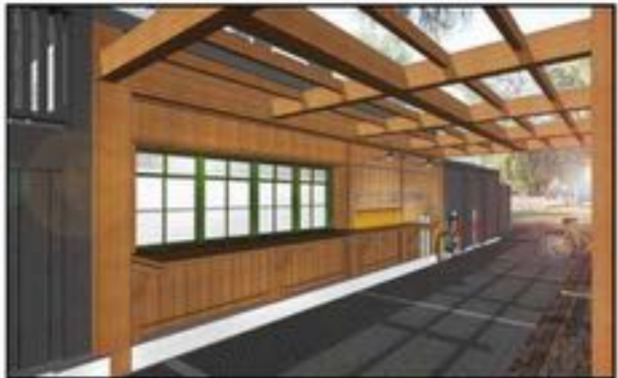
Figure 10: Design Concept - Exterior Concession & Bike Service Station (northeast facing)